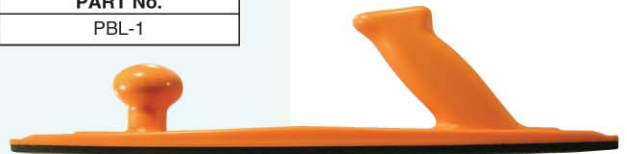
PART No. PBL-1

Made of durable, strong shatter proof plastic with a heavy duty rubber foam pad that will not mark the workpiece.