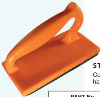
STRAIGHT Comfortable straight handle