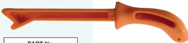
PART No. PS-1