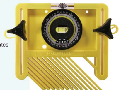
PART No. FAM-1

Can be used to control passage of timber horizontally on router tables or vertically on the fence as a hold down. Spirit level indicates exact angle of timber passage.