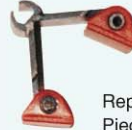
Replacement Corner Pieces Pk 4 (TVCP)