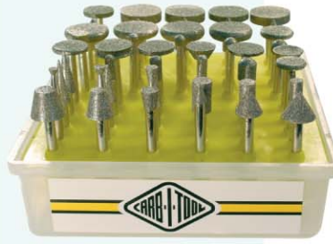
50 pce - 1/8" shank