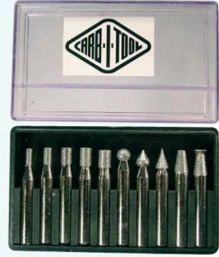
10 pce - 1/4" shank