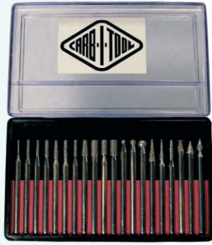
20 pce - 1/8" shank

Ideal for carving and engraving on wood, ceramics, glass and other hard materials.